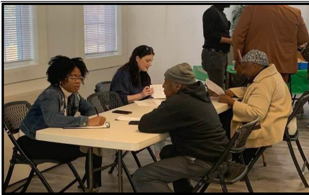
Health and Wellness