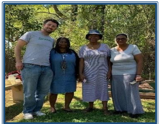
Envisioning the Future