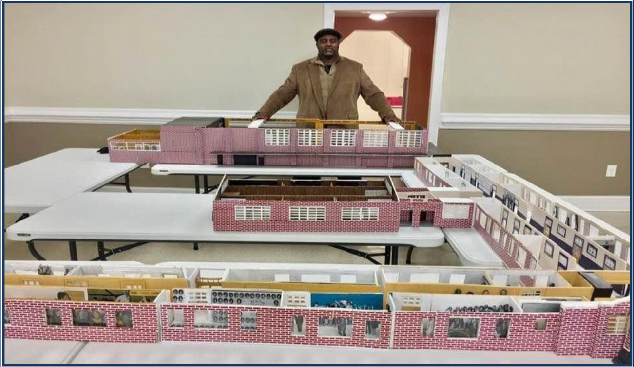
Prototype of the original H.B. Sugg designed and produced by Dominique Baker