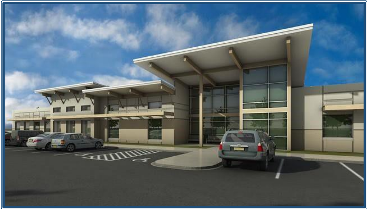
Prototype of the future Wellness Center -- Photo for visual purposes only.

The HHBSS strategic plan recommends that the gym be converted into a Community Wellness Center. A wellness center is an umbrella concept that services several dimensions of wellness. It caters toward physical, emotional, social, and spiritual wellness. The Community Wellness Center will provide a wide range of programs including but not limited to addressing physical, emotional, social, and spiritual wellness for all ages. In order to achieve this strategy, it will require developing a business plan, creating a branding and marketing plan, designing a logo and website development. The community wellness center will represent the entire soul of the school's business plan relating to the vision and mission, thus serving and educating people for better living.