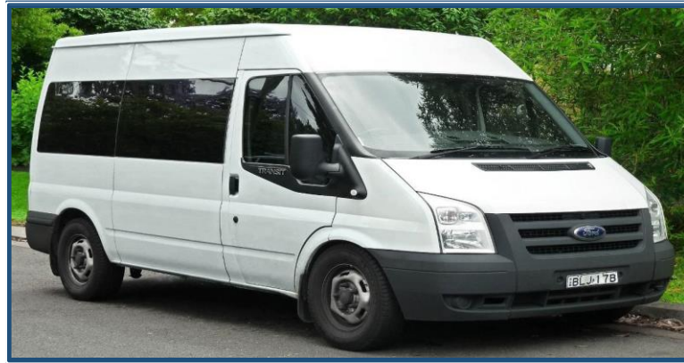
Prototype transport vehicle - for visual purpose from Bing Photo