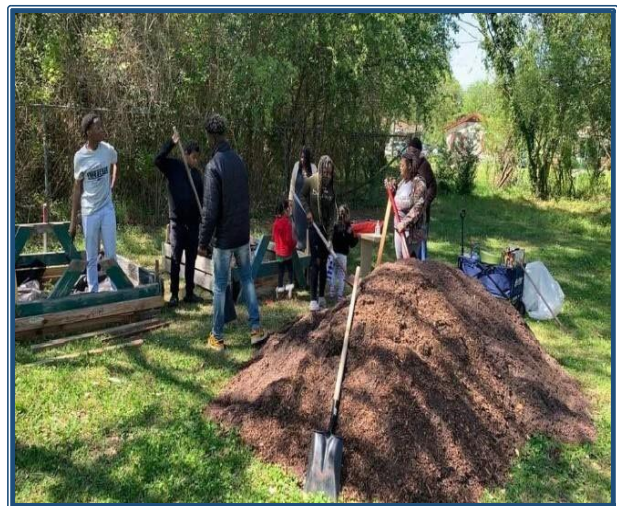
Community Garden Program