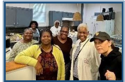
Fundraising Team Members