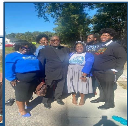
Youth Development Programs