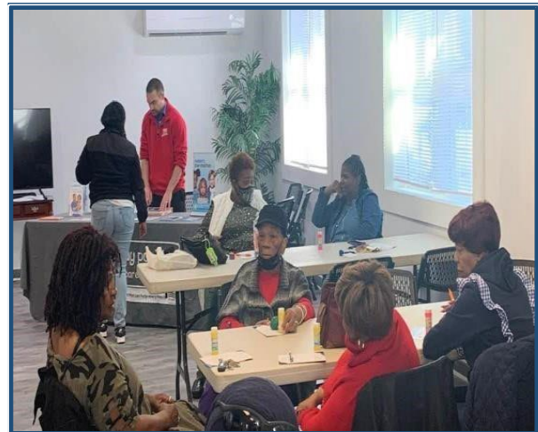
Health and Wellness programs