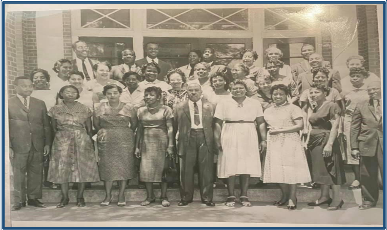
Former Principal and Faculty of H.B. Sugg School