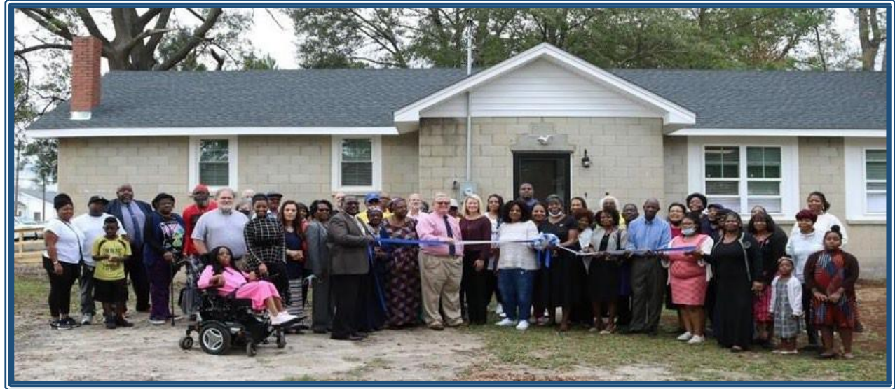
HHBSS remodel vision is based on this renovation - Ribbon cutting of the H.B. Sugg Economic Building.

The mission of the HHBSS is to preserve, enhance, and utilize the iconic building, fulfilling the vision through education, economics, empowerment, and engagement.